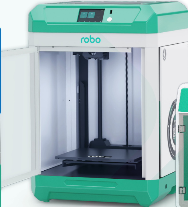
robo E4 Pro Large Volume Professional 3D Printer